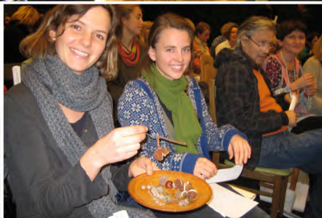
From the opening weekend The Art of Looking Sideways - Reflections on the Art of Actions . There were around 80 participants at the seminar on Saturday the 23rd October and four fully subscribed workshops on the following Sunday.