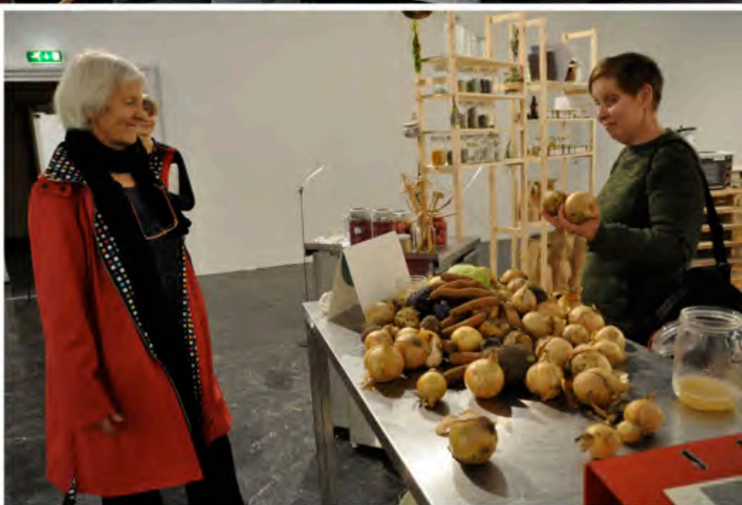
Below: The last day the English art and activist group PLATFORM held a workshop on art and activism. The rest of the vegetables from FOOD AS COUNTERCULTURE was handed out to passing guests.