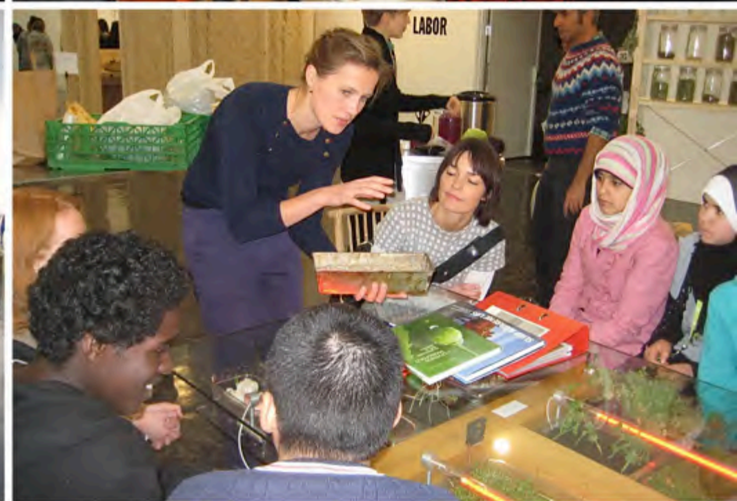
Above: "Minihuset" at Gentle Actions . It was so popular that Kunstnernes Hus had to extend the opening days. Below: There were five days with workshops and tours for 8th og 9th grade with "Den Kulturelle Skolesekken".